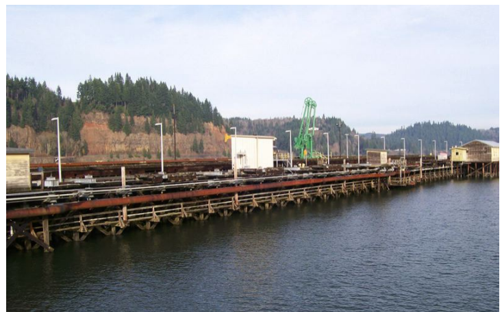
A dock at Port Westward allows ships to load and offload materials produced or transported via the industrial park. NEXT Renewable Fuels plans to develop a diesel plant at Port Westward.

The site is scheduled to open in 2021 and employ an estimated 200 workers.